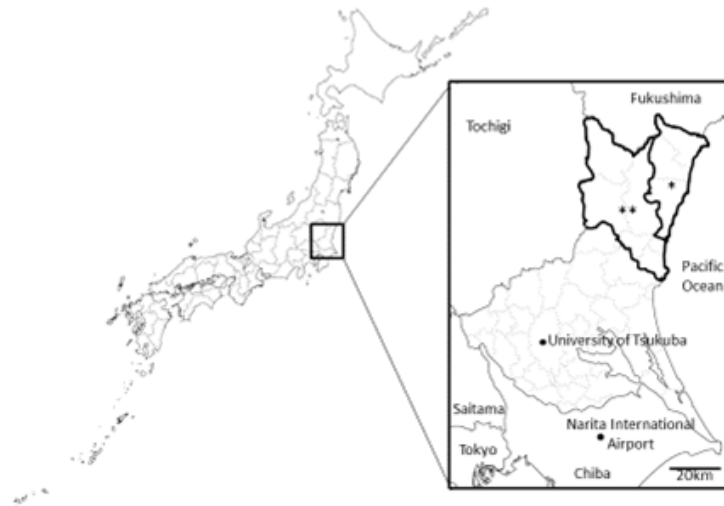
Figure 1: Surgeries in the study cases were performed in outpatient clinics in the Hitachi (*) and Hitachinaka (**) medical-care zones (see inset) of Ibaraki Prefecture (magnified in the inset) in Japan. These two zones include seven cities, one town, and one village (Hitachi, Takahagi, Kitaibaraki, Hitachiota, Hitachiomiya, Hitachinaka, Naka, Daigo, and Tokai).