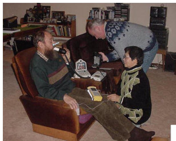
Figure 3: Local volunteer attendants acquire clinical information from a simulated patient. The doctor can be seen supervising via videophone.

attendants can be trained to acquire considerable medical data for either real-time or store-and-forward transmission to the clinician. There is considerable literature on the value of lay assistants in this context 17,18 . In the present study, volunteers were recruited by local advertisement, and trained and supervised by staff at The Greater Green Triangle (GGT)Deakin/Flinders UDRH. Lay volunteers can be trained readily to measure blood pressure (using, for example, an Omron T8 [JA Davey Pty Ltd; Melbourne, Vic, Australia] automatic sphygmomanometer), perform basic lung function tests (using a portable automatic spirometer such as the Cosmed ‘Pony’ T8 [Cosmed; Rome, Italy]), perform an ECG (such as Philips PageWriter 10i [Philips Australasia; Sydney, NSW, Australia]) and even to acquire heart and lung sounds using a digital stethoscope (Stethographics Inc; Boston, MA, USA). All this is performed under the supervision of the doctor who is on-line via the videophone. Other ‘peripheral’ adjuncts which the authors use include pulse oximeter, tympanic thermometer, glucometer, dipstick urinalysis, scales for weight records, otoscope, laryngoscope or alternatively flavoured spatulas and a digital camera (Fig 3). The authors’ attendants have also been trained to use ‘BabyCheck’ 19 when presenting an infant to a doctor. The community volunteer completes a Virtual Clinic Patient Care Record (Fig 4).