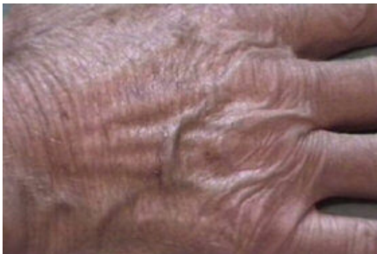
Figure 1: The degree of detail obtainable via videophone using ordinary phone lines.

The small pilot study described used an ‘off-the-shelf’ videophone (MotionMedia 125; Videophone Communications Pty Ltd; Melbourne, Vic, Australia) which has a freeze function, as well as the capability for the operator to control frame rate to adjust balance between smoothness (motion) and clarity (detail). This videophone also has a port to take a second camera. If a digital camera is used, a much better quality video is achieved, which together with the freeze mode gives surprising detail to the remote observer (Figs 1,2).