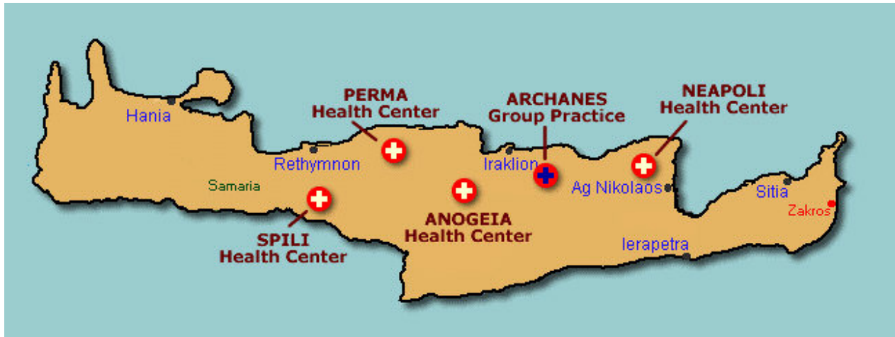
Figure 1: Map of the study area, Crete.