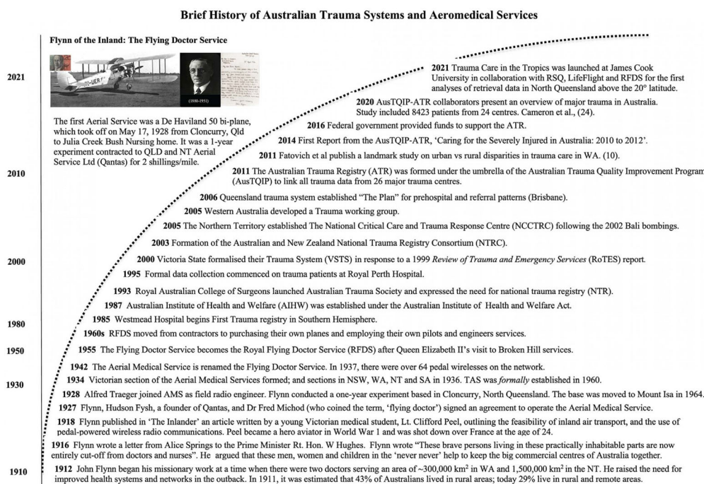
Figure 1: A brief history of Flynn's vision for a 'mantle of safety' throughout inland Australia, the early formation of the Royal Flying Doctor Service, and the formation and ongoing challenges facing the Australian trauma registry founded in 2011.