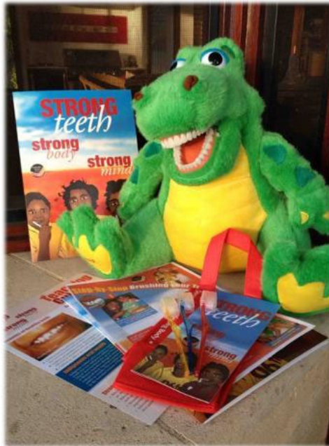
Figure 2: Strong Teeth, Strong Body, Strong Mind teaching guide, educational booklet and mascot Craig the Croc.