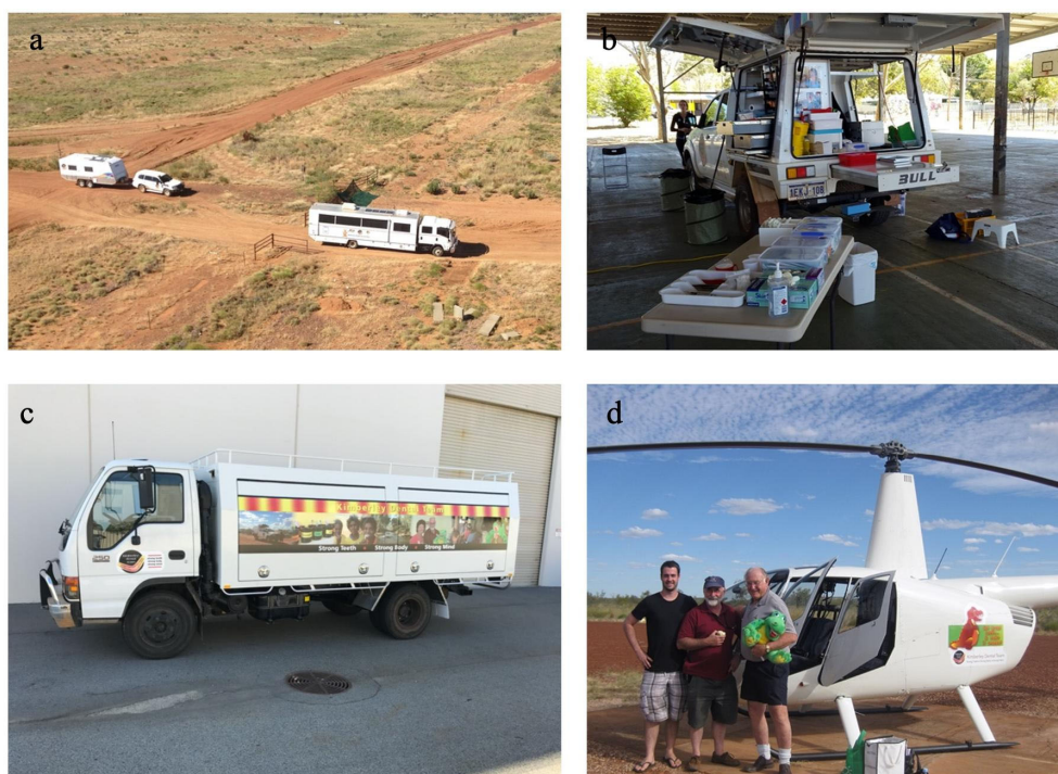
Figure 5: Mobile dental vehicles: (a) Kimberley Aboriginal Medical Services/Kimberley Dental Team (KDT) truck and McCusker Charitable Foundation/KDT dental caravan. (b) Modified Toyota HiLux dual-cab truck. (c) KDT transport truck. (d) A helicopter visit to remote schools.

Accommodation: Accommodation of large volunteer teams in community is a significant logistical challenge that is often overlooked. In some instances, short-term nursing housing is rented, while in other instances camping equipment is used to facilitate short-term lodging. These extraneous factors and equipment add several dimensions to the service delivery model, which extends beyond simply providing clinical care. However, the notion of living and working together in community plays a significant role in the degree of cultural immersion and team bonding, which are unique to volunteer-based models of care – leading to a sense of family and belonging 13,26 .