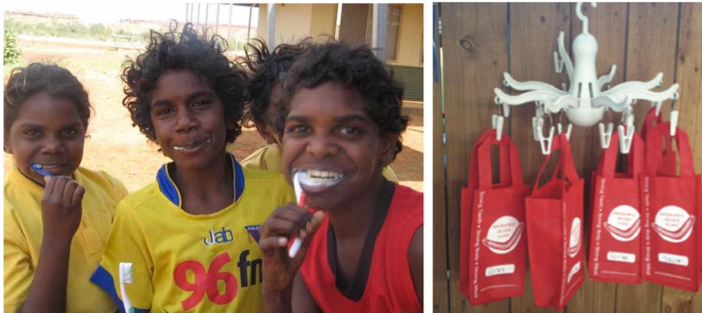
Figure 3: Left: Children involved in the Strong Teeth for Kimberley Kids toothbrushing program. Right: Kimberley Dental Team recyclable bags used by each child to store their toothbrush and toothpaste while at school.

School-based screening: The supervised toothbrushing program is complemented by annual dental check-ups by KDT, which visits communities by invitation. Each community is aware of the visits ahead of time and thus the school is able to distribute consent forms and liaise with parents beforehand. During a typical KDT trip, a team of volunteers will visit school classrooms, conducting an examination (with charting), a plaque index, orthodontic classification and triaging each child based on caries risk and treatment needs. The use of Craig the Croc as a mascot encourages participation and enthusiasm among the children and helps mitigate any immediate feelings of dental anxiety, particularly among younger children (Fig2).