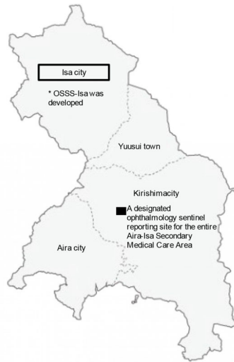
OSSS-Isa, ophthalmology sentinel surveillance system in Isa city.