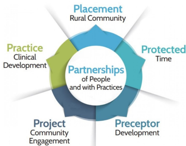
Figure 1: The 6 Ps: a novel cohort Fellowship.