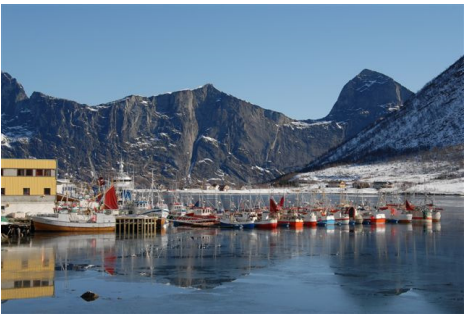
Figure 1: Maps of (A) Norway and neighboring countries and (B) Senja and adjacent mainland. Arrows show location of Senja. (C) The fishing village of Senja.

The joint GP service is today named in Norwegian Senjalegen ('the Senja Doctor')