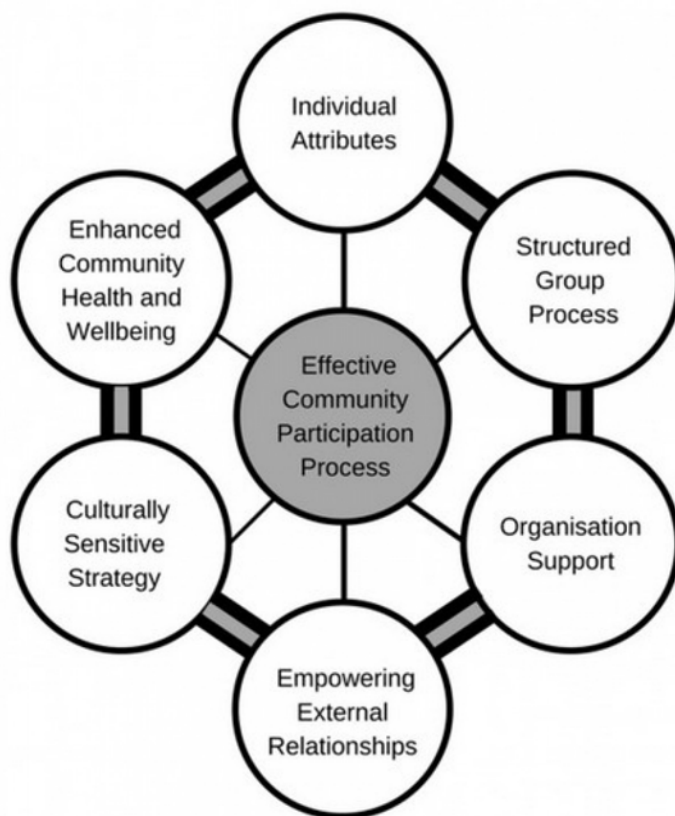
Figure 1: The integrated YARN model 3 .

Audio-recorded interviews were transcribed and de-identified to ensure anonymity and then organised for thematic analysis 9 . A deductive content analysis approach was used through comparing evaluation results to the YARN framework 10 . Coding and categorisation were undertaken individually and a final list addressing the study purpose was selected from the collection of discerned themes, following dialogue between the coding authors. Whilst the evaluation participants were not involved in data analysis, three members of the authorship team, who are Aboriginal, provided insight to the results from a cultural perspective. The voices and language of the participants have been used in reporting the results.