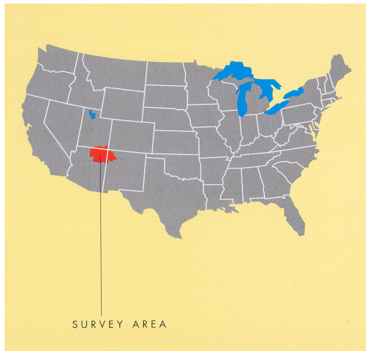
Figure 1: The US region known as ‘Arizona and New Mexico Indian Country’.

Although professionals outside the community have predominated through IHS, jobs for local residents in ancillary and technical positions have been provided. Residents play an extremely important role in healthcare delivery as aides, technicians, and practical nurses and have provided a cultural interface for the system. This group of residents is a unique resource for the Navajoland community as they already possess grounded knowledge of both community and healthcare system workings. This particular study evaluated the circumstances of those individuals already working within the health system in any capacity to discover the stories, interests, and needs related to their health career goals and advancement. The aim was to identify what would be helpful to support educational and career progress, and to determine the barriers to advancement.