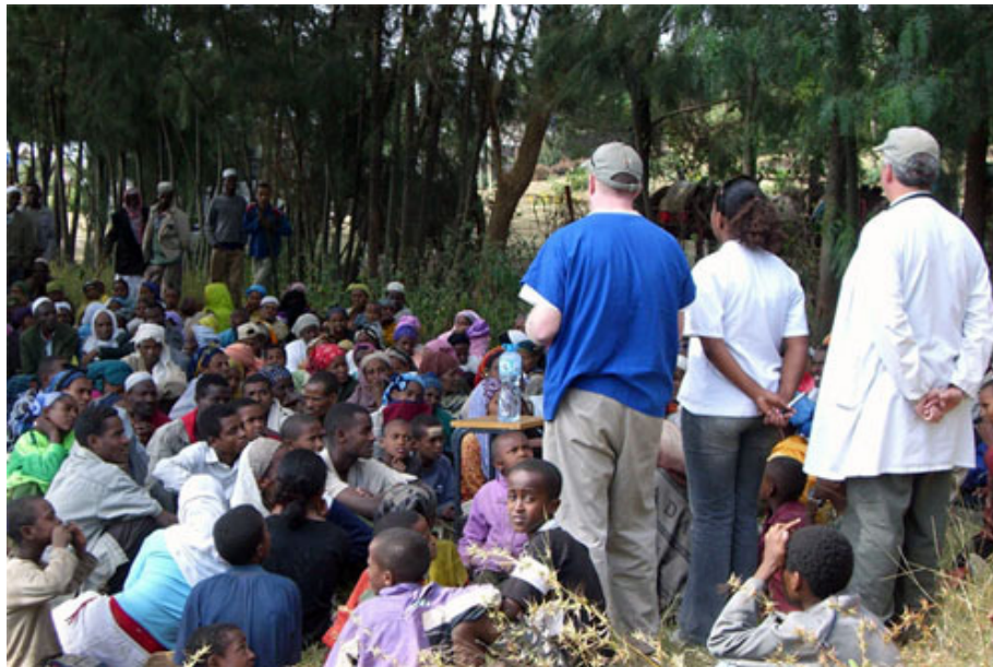
Figure 2: The team leader, chief physician and one of the nurse-translators communicating with the crowd in ‘the talk’.