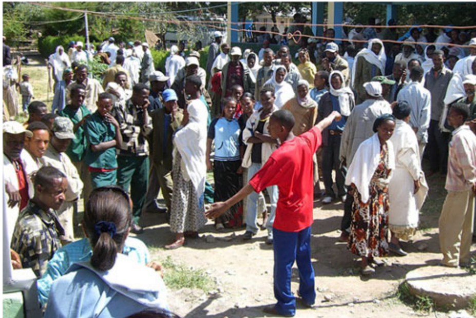
Figure 1: One of the local community activists helping the team organize the crowd prior to the pre-triage process.