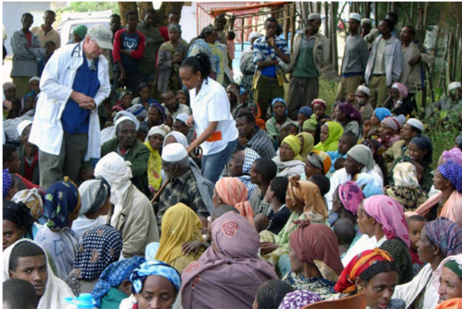
Figure 3: The physician and nurse-translator going into a section of the crowd to select patients.